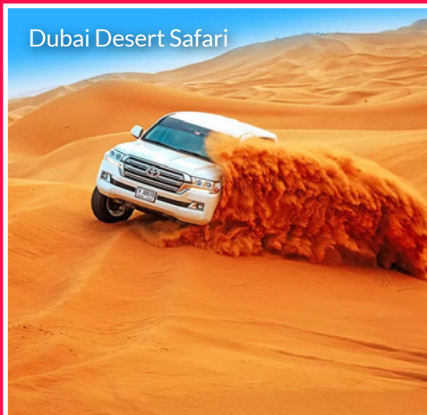
Dubai Desert Safari