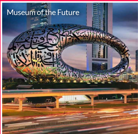
Museum of the Future