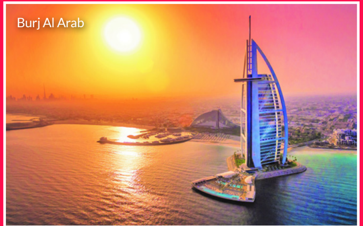
Burj Al Arab