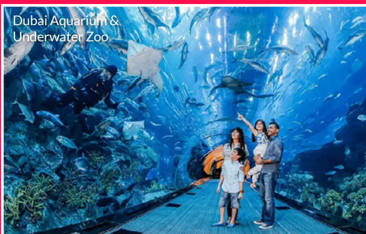
Dubai Aquarium & Underwater Zoo