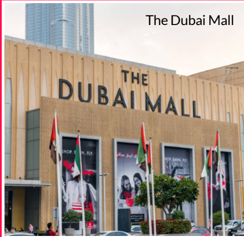
The Dubai Mall