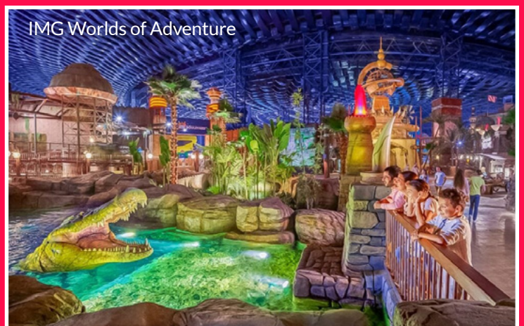
IMG Worlds of Adventure