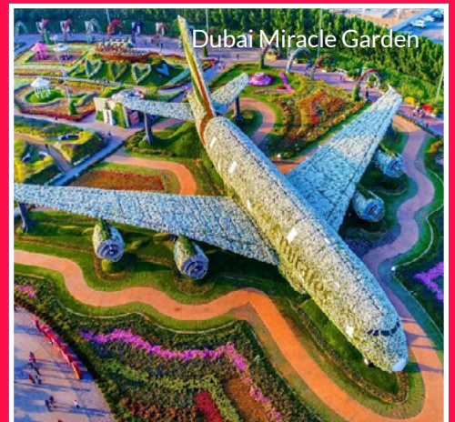
Dubai Miracle Garden